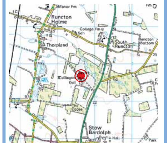
Ordnance Survey mapping © Crown copyright Media 031/13