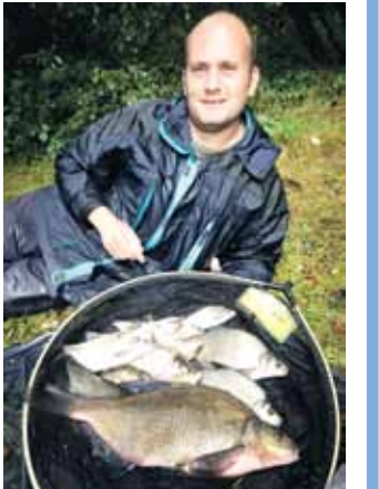
Skimmers and a 'proper' bream.

LAKE FOUR - The club gained the lease to this water at the beginning of the year and its stocks are a bit of a mystery. Members that have ventured on to it have taken double-figure nets of rudd and perch on waggler and maggots tactics.